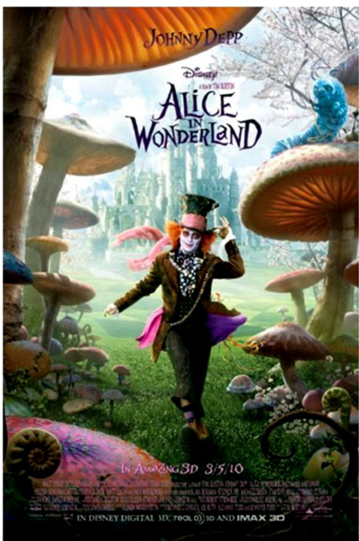
Alice in Wonderland Walt Disney Pictures, 2010

'Twas brillig, and the slithy toves Did gyre and gimble in the wabe: All mimsy were the borogoves, And the mome raths outgrabe.